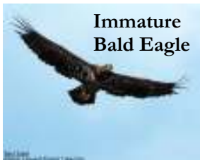
Immature Bald Eagle