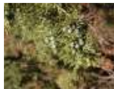
mahala mat (also known as prostrate ceano- thus) Ceanothus prostratus