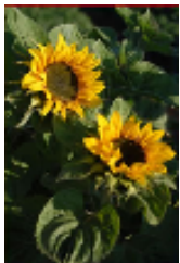
Common Sunflower: Roadsides and other disturbed areas at low elevations, bright yellow ray flowers with red-dish-brown centers