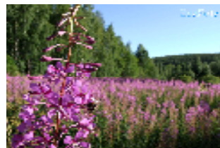
Fireweed: forest opening, riparian area, often disturbed sites