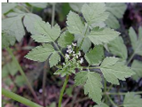
Sweet Cicely: moist forest, low to mid elevation