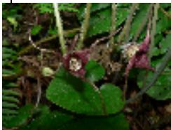
Wild Ginger: Moist shady forest and streamsides.