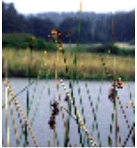
Tule Bulrush: Marshes and ditches, often in standing water with cattails