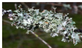
Rag Lichen: on a tree trunk in a conifer and subalpine forest