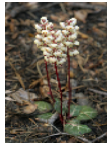
White Veined Wintergreen: Mixed conifer and subalpine forest, tolerant of shade.