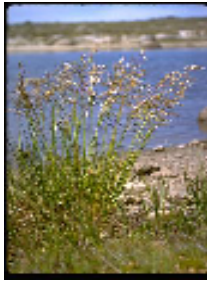
Tufted Hairgrass: moist to wet meadows and edges of wetlands