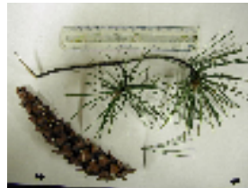
Western White Pine: mixed conifer and subalpine forest