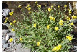
Meadow Arnica: mountain meadow and streamside – lower stem is underwater