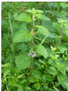
Field Mint: streamsides, moist meadows, ditches, and pond margins, has a square stem