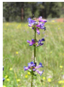
Meadow Penstemon: Lake of the Woods Recrea- tion area, along streambanks