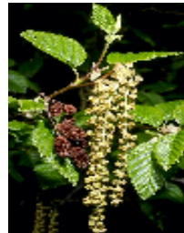
Mountain Alder: streamside and lakes