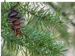
Douglas Fir: mixed conifer forest