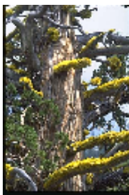
Wolf Lichen: sunny forest opening on a dead conifer