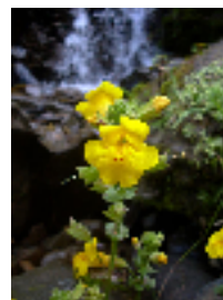
Monkey Flower: Seeps, springs, meadows, and streamsides at all elevation