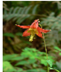
Columbine: Moist forest, streamsides, springs, and seeps