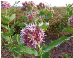
Showy Milkweed: fields, meadows and along roadsides