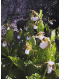
Mountain Ladyslipper- mixed conifer forest often in drainages